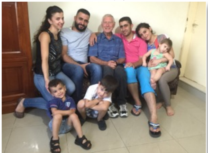
Below: The two families that benefitted from the repatriation project.