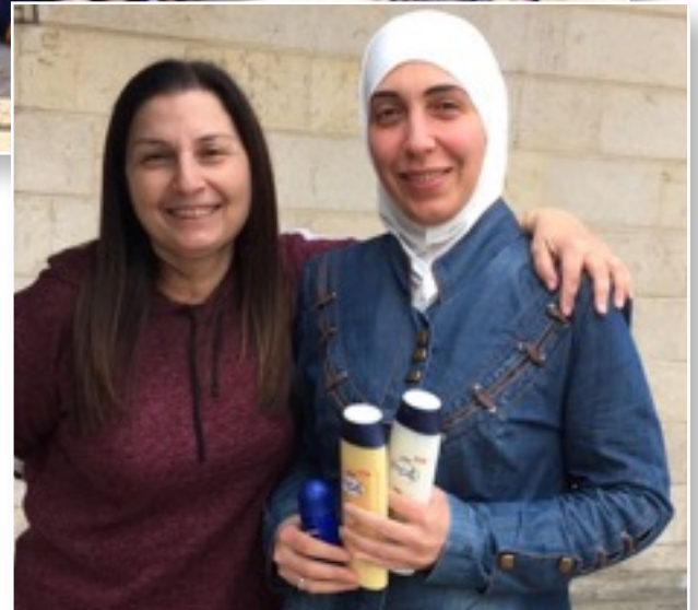
Above & Below: Pictures of Syrian women in the camps receiving education on hygiene practices

In the first 6 months of 2018, we held a number of hygiene awareness campaigns for the women and young ladies in the Syrian camps in Bekaa Valley. For this purpose, an American team of a doctor, nurse, and 3 other volunteers came to Lebanon and shared their knowledge and life experience with these ladies. They educated them on more effective ways to limit the spread of diseases and better means to strengthen one's immunity. The ladies were enthusiastically interactive in the sessions and showed great interest in learning and adapting to better hygiene practices.