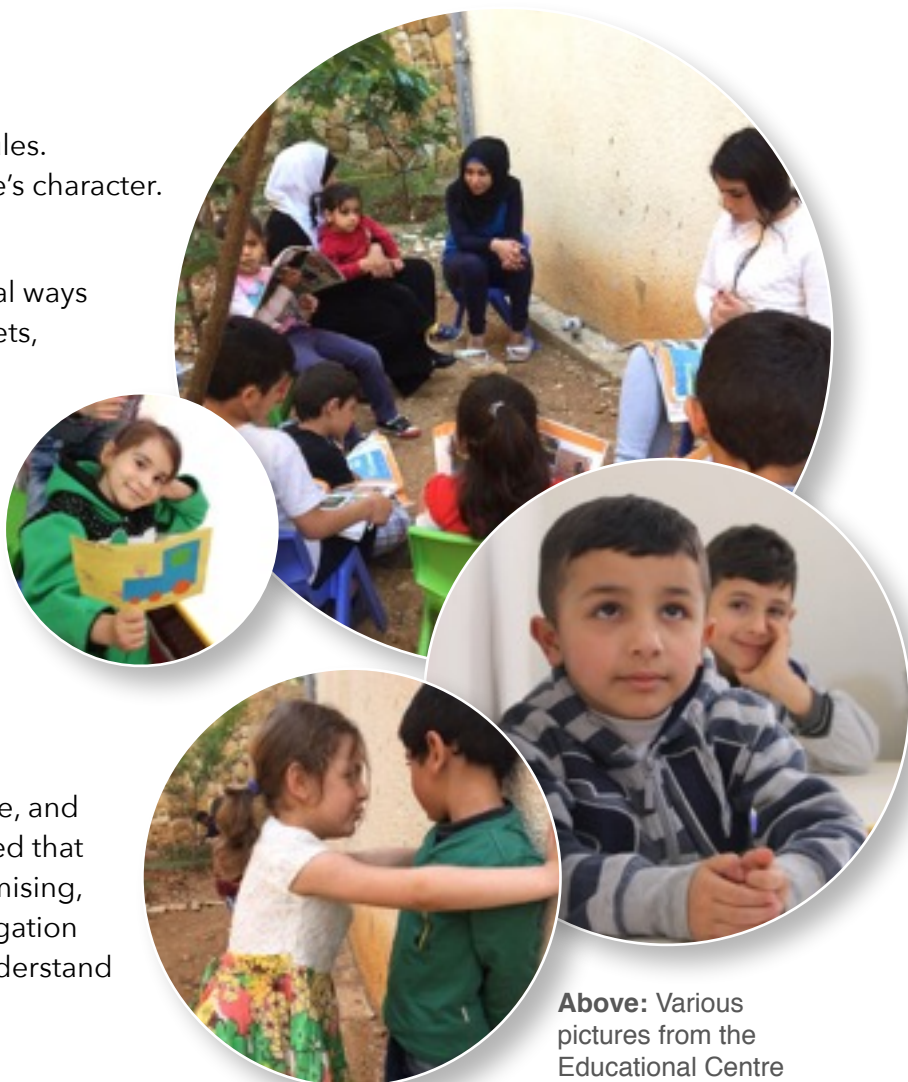
Above: Various pictures from the Educational Centre

Students learn to team-work, collaborate, and share what they have! We have witnessed that their friendship bonds have been maximising, while their actions of bullying and derogation diminishing! Students have come to understand and implement tolerance and to refuse discrimination on any basis!