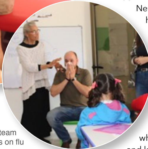
Right: The American team educating the students on flu

Based on our commitment and dedication to help our children grow in stature and maintain a proper health, New Vision asked a licensed dietician to set a monthly well-balanced meal plan for the students. The plan ensures their consumption of the adequate nutrients their bodies and immunity need to grow strong!