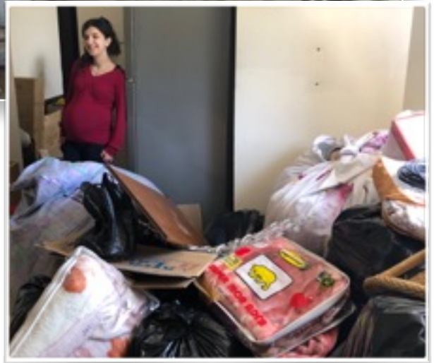
Above: Beneficiaries packing their belongings to travel back to Syria.

While many Syrians in Lebanon dream of immigrating to the West for a fresh start, many others dream of a safe repatriation to their homeland, where they can reunite with their families, enjoy community life, and establish a new hopeful future. When we first started thinking about repatriation, the whole idea sounded far fetched. Nonetheless, with further investigations, we found that many families are ready and willing to seek the deep hope of repatriation and reunification. The first obstacle to overcome is to provide them with a roof above their head when in Syria! We started the Repatriation Project with two families. These families have packed their stuff and belongings in May 2018 and set off to Al Qusair, Syria, to supervise the process of their house rebuilding. Our goal is to help 48 more Syrian families in 2 years!